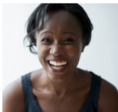
In Between Jobs